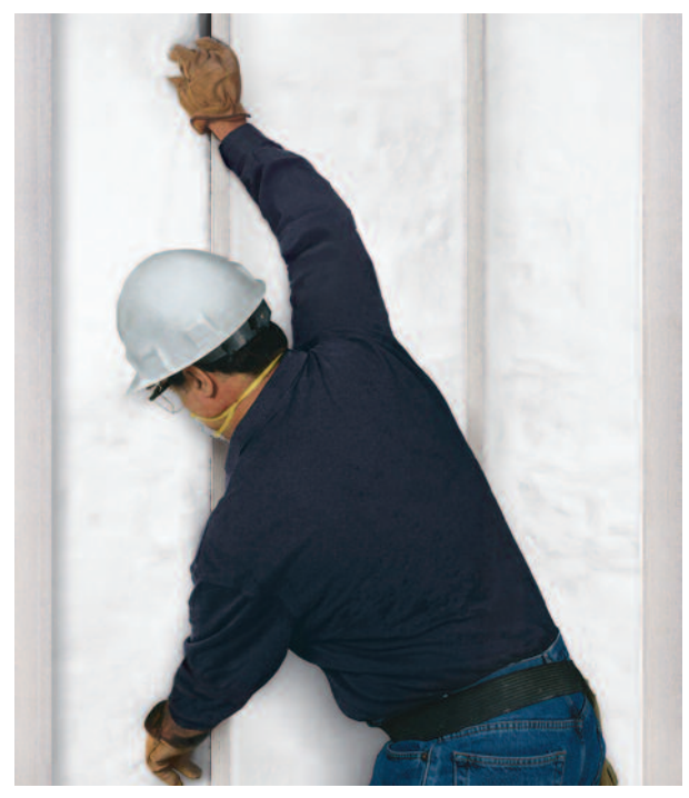
Acoustical insulation being installed in interior wall cavities.

In addition, all exterior penetrations and joints between building components should be sealed as required for thermal performance. This will also improve the acoustical performance.