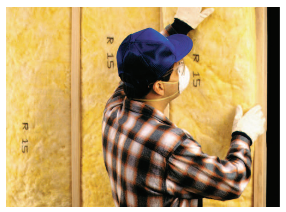
Fiber glass acoustic insulation being installed in an exterior wall.

If a residence is impacted by overhead aircraft, then resilient channels should be used in roof/ceiling assemblies as well as using at least 9 inches of blown-in fiber glass insulation in the attic. The insulation should overlap the top of the joists by at least 1 inch. If a vapor retarder is installed, make sure it is toward the heated side of the home. Humid climates may require the vapor retarder to be installed facing the exterior of the wall. Check local building codes for the location of vapor retarder.