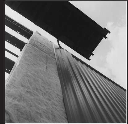
NAIMA 202-96® (Rev. 2000) Certified Fiber Glass Metal Building Insulation is produced in a special manufacturing process to give it the structural integrity it needs to recover thickness after lamination, shipping and installation.